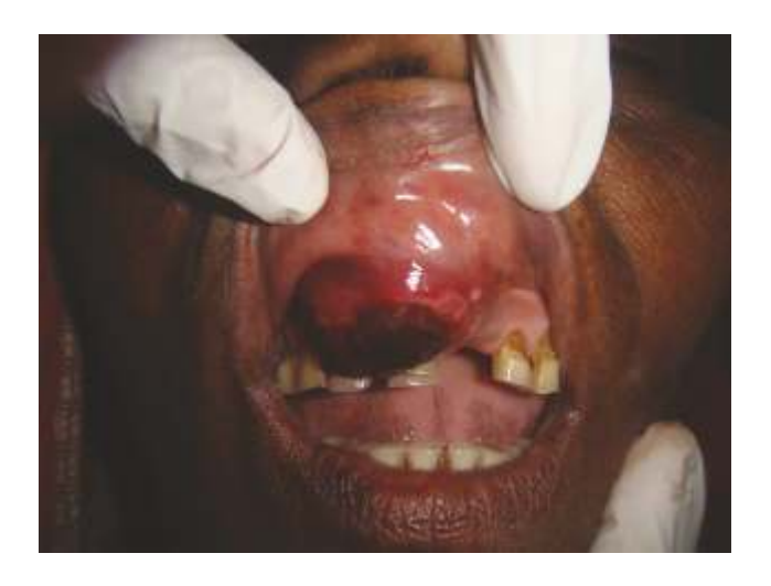
Fig. 1: Oral Hematoma in the Maxillary Anterior Gingiva

Patient was subjected to intraoral periapical radiograph with respect to 11,12 and 21 panoramic radiograph and maxillary occlusal radiographic examinations that revealed no significant findings except for gross attrition of all the teeth and especially with 11,12 and 22, infected root stump with respect to 21 with associated severe interdental bone loss (Fig.2). On hematological investigations, there was elevated International Normalized Ratio (INR)of 6.15, increased Prothrombin Time (PT) of 46 seconds, Partial Thromoplastin Time (PTT) was 63.8 seconds and the platelet count was 1.87 lakhs/cmm and other hematological reports were within normal limits.